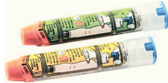
EpiPen® Autoinjector Junior and Adult

Airway, breathing and circulatory problems. Unconscious. Cardiac arrest.